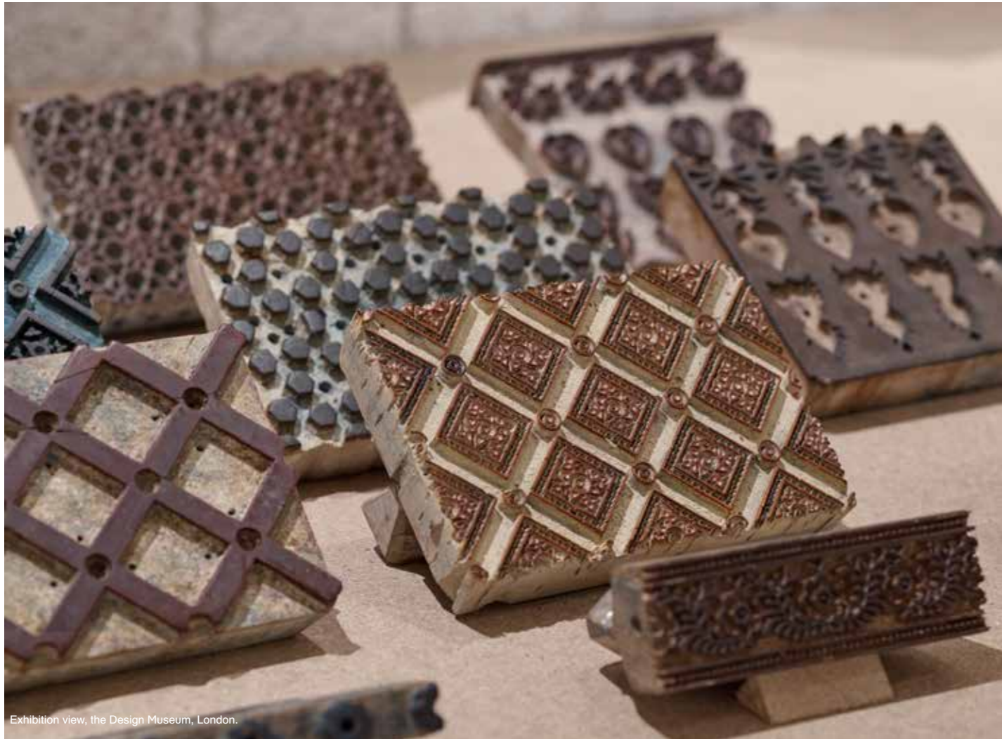
Exhibition view, the Design Museum, London.