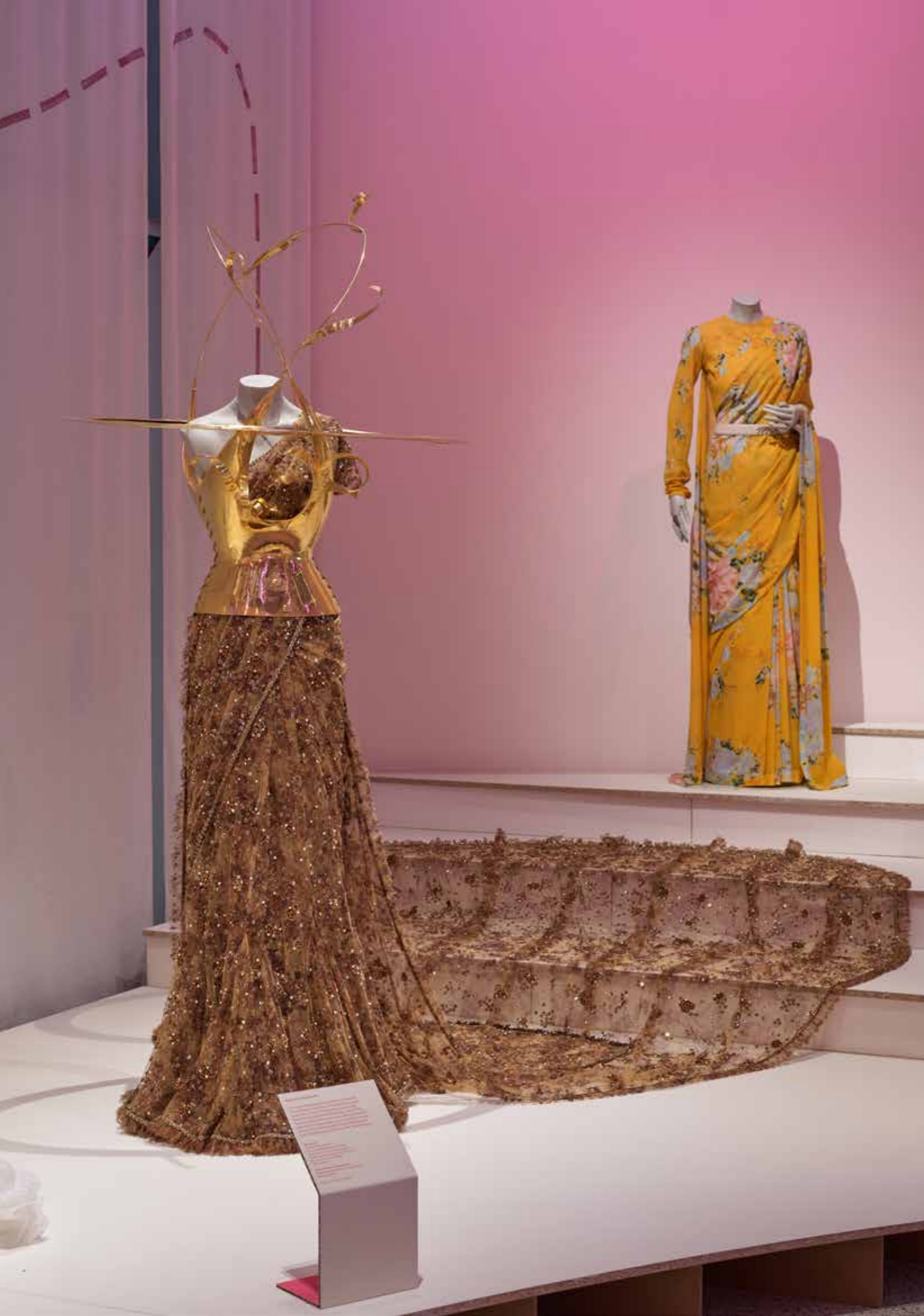
Exhibition view, the Design Museum, London.