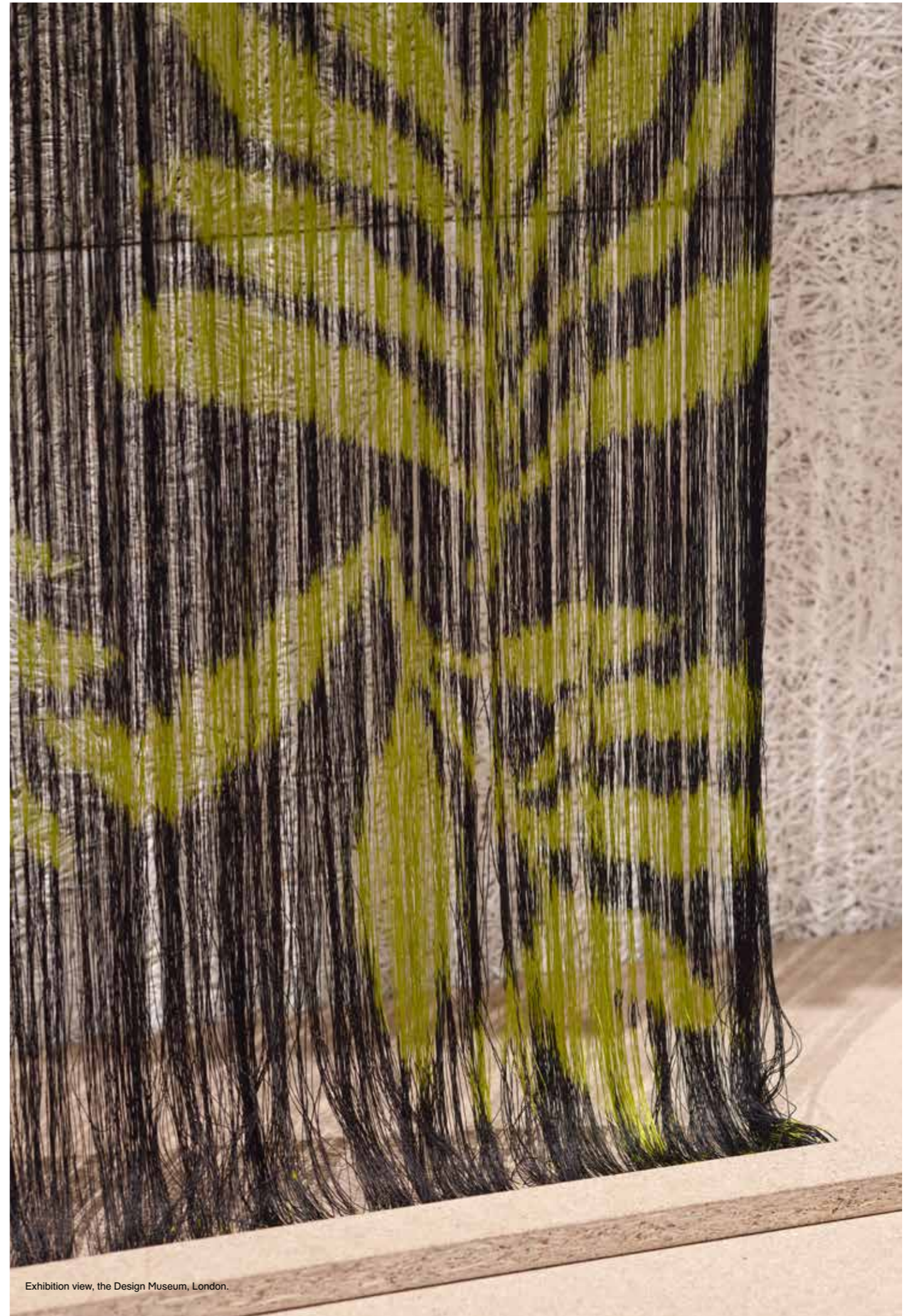
Exhibition view, the Design Museum, London.