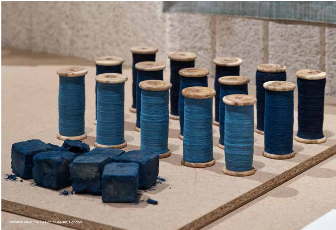
Exhibition view, the Design Museum, London.