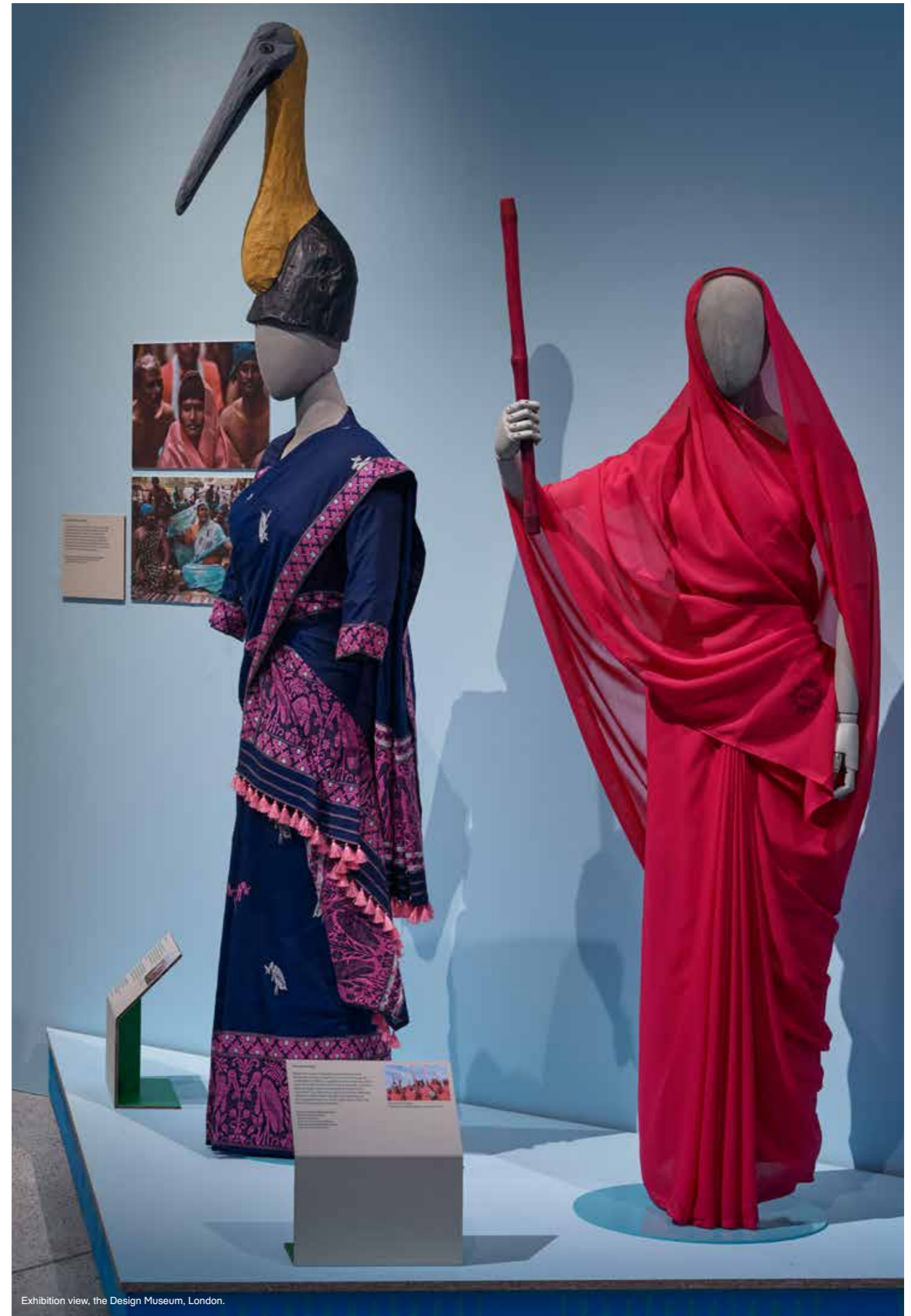
Exhibition view, the Design Museum, London.