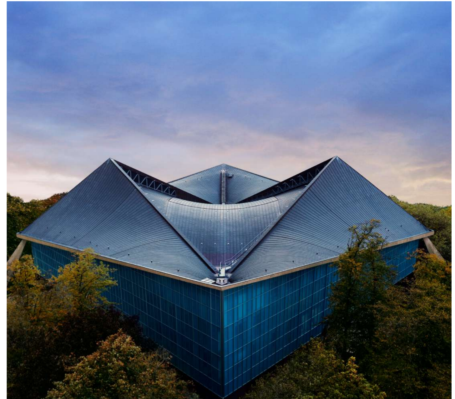
The Design Museum